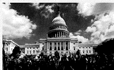
Visit the Capitol!