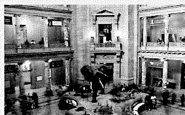
Explore the Smithsonian's!